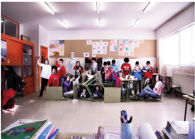
Figure 1. Photographs by contemporary artist Jesús Madriñán, students of the Faculty of Education and students of CEIP "Emilia Pardo Bazán" Primary School.