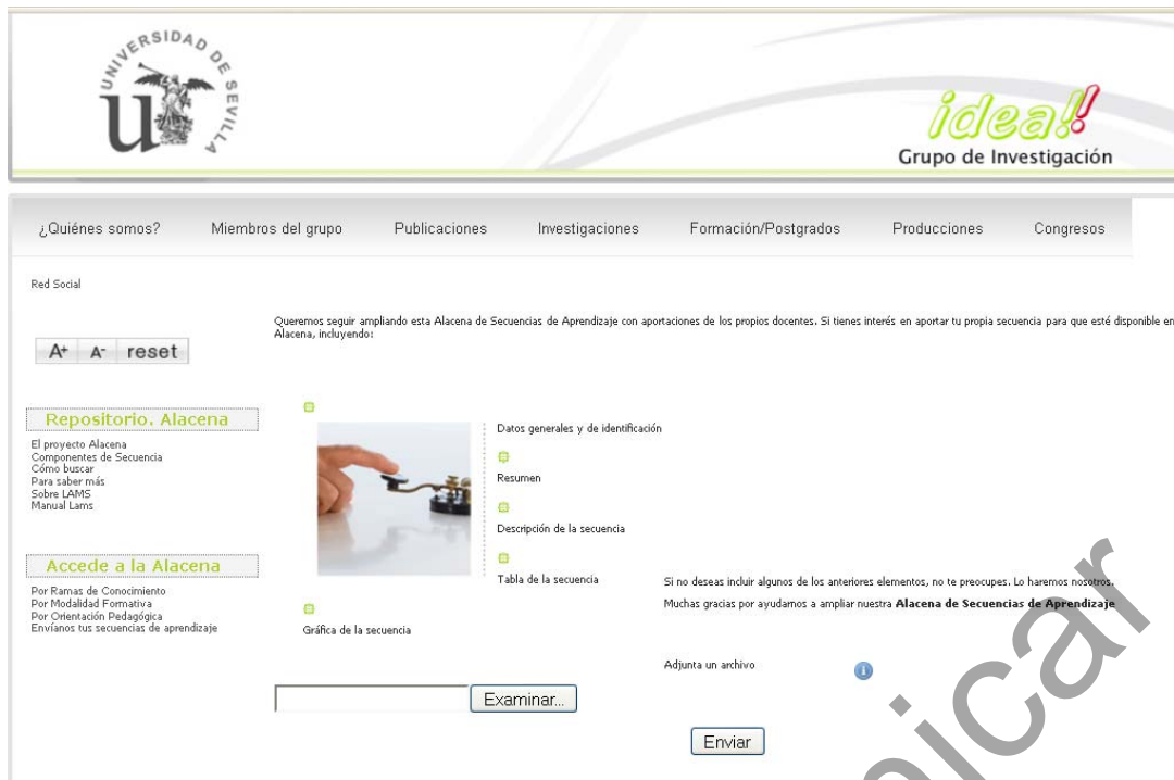
Figure 2. Uploading tool in the Alacena repository.

In order to develop the representations of the learning sequences, a standardised design language is required, i.e. a notation that describes the learning design in an interpretable way (Koper & Bennett, 2008). By notation, the system of conventional signs that is adopted to express concepts is understood. A number of attempts are now emerging to comprehensively document learning designs, with the effect that there are currently many types of representation that can serve a wide range of different purposes. As examples of these initiatives, Agostinho (2008) highlights: E2ML, IMS Learning Design, Learning Design Visual Sequence, LDLite, Learning Activity Management System and the design patterns. Richards & Knight (2005), McAndrew, Goodyear & Dalziel (2006), Cameron (2007), and Falconer & al. (2007), have also offered their review of the existing representations.