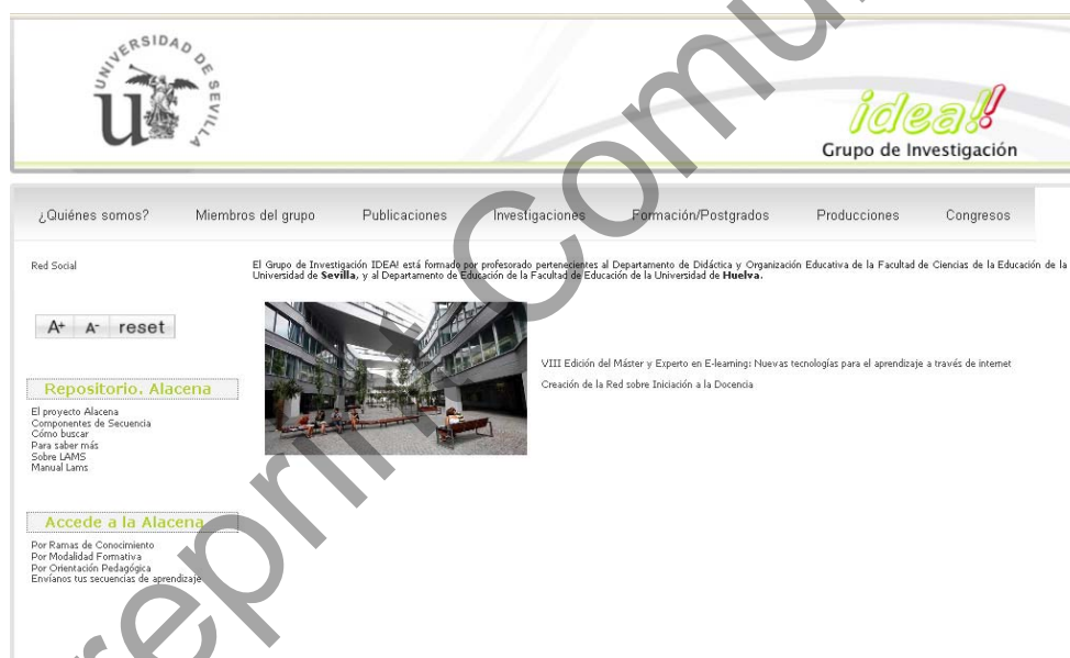
Figure 1. Screenshot of the web page and the Alacena repository.

All fifty-eight learning sequences are available in the sequence depository that we have called Alacena. This repository is available on our investigation group's web page, as indicated above, http://prometeo.us.es/idea