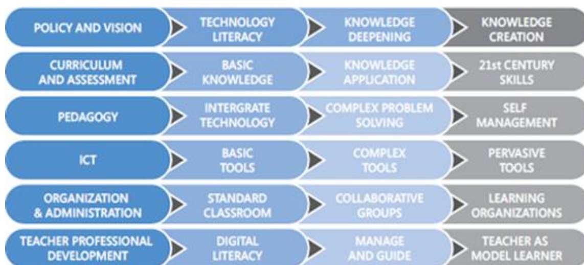
Figure 2. Modules of the UNESCO ICT Competency Framework for Teachers (UNESCO, 2008).

The goal of UNESCO's ICT-CST project has been to produce the UNESCO ICT Competency Standards for Teachers (ICT-CST) framework shown in Figure 2: