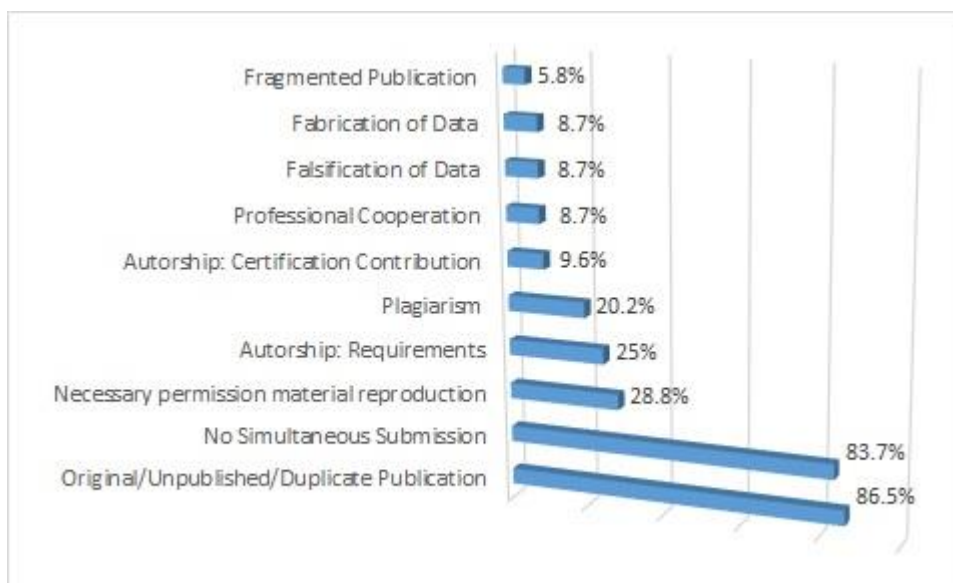
Graphic 3. Submission and publication of papers: ethical policies (n=104).

Thus, it may be concluded that there is a significant correlation between a given journal's impact factor (IF) and a number of the ethical principles addressed here: 1) the protection of the rights of research participants ( U=358 ; p=0.000 ; IC=95.5 ); 2) the protection of animal welfare ( U=195.5 ; p=0.002 ; IC=95.5 ); 3) conflict of interest ( U=533.5 ; p=0.000 ; IC=95.5 ); 4) permissions required ( U=650.5 ; p=0.001 ; IC=95.5 ); 5) authorship requirements ( U=472 ; p=0.000 ; IC=95.5 ); 6) authorship contributions ( U=228 ; p=0.008 ; IC=5.5 ); and 7) fragmented publication ( U=149 ; p=0.043 ; IC=95.5 ). All of the analyses disclose that such ethical policies are more prevalent in journals with higher IF values, and that this correlation is statistically significant. No other significant differences are discerned in relation to the other ethical policies ( p>0.05 ).