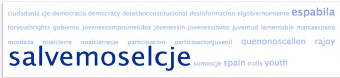
Figure 3. The relevance of related hashtags on September 11 th , 2014.