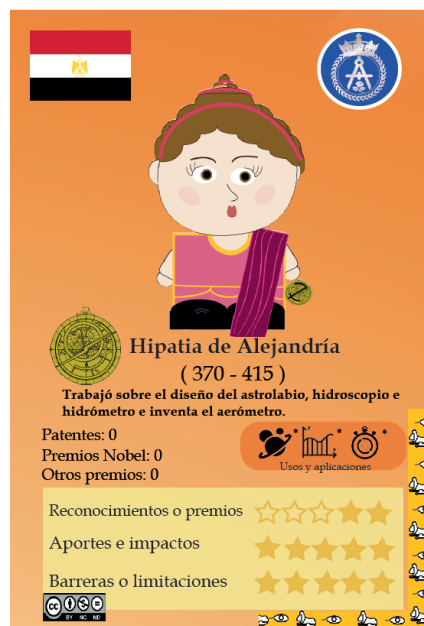
Figure 2. Hypatia of Alexandria's card.

The last stage was the design of biographical cards for the characters. These were made using Adobe Photoshop, Indesign and Illustrator. Figure 2 shows the design of the card, with an example of one of the 32 cards, which corresponds to 'Hypatia of Alexandria'. The center shows the image of the character, her name, date of birth and death, a brief description and symbol of her work. Attached are symbols of the most representative uses and applications to which she contributed. The characters were portrayed by means of geometric figures, taking as a reference their main features to recreate their image in an animated and simple way; the color of the cards was used to identify the gender, green for male scientists and orange for female scientists. Regarding the category related to STEM areas, different color logos were designed with symbols alluding to the professions; these are presented in the upper right corner. On the other hand, in the lower right corner, there is a border of a different color with symbols of the historical period in which the character lived. The origin of the character is represented by each country's flag. Finally, the criteria were represented by star ratings and the number of awards or recognitions received by the character.