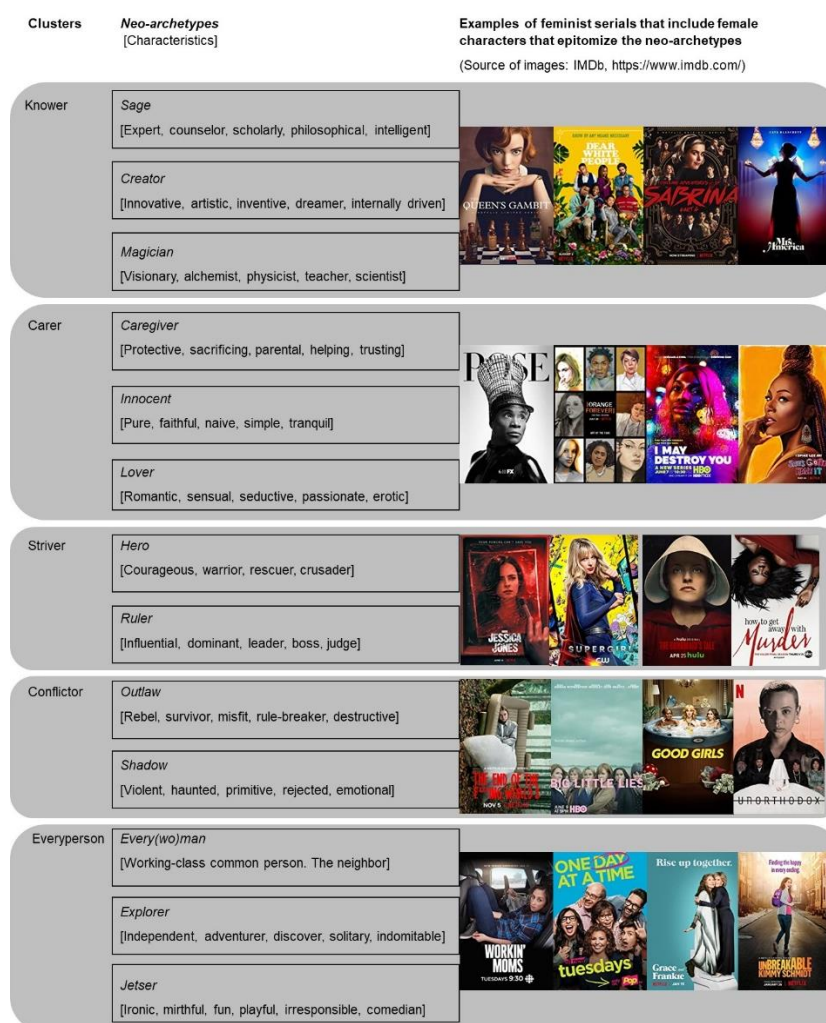
Neo-archetypes' characteristics and examples of feminist serials that include them

Following the selected criteria, 25 series were identified as feminist. Table 1 (available at https://doi.org/10.6084/m9.figshare.14109701 ) describes their main elements (i.e., title, original release, streaming networks, genre, accolades), so as their female presence on-screen/off-screen and their relation with #MeToo and #TimesUp, regarding their topics and the inclusion of feminist actresses, directors, etc. Results show a relation between a high female presence on-screen/off-screen (many of them explicitly linked to #MeToo and #Time'sUp) and the inclusion of feminist content. Thereupon, we will go deeper into this data while good practices of female portrayals are described following the Neo-archetypal theory (Faber & Mayer, 2009). Figure 3 offers an overview.