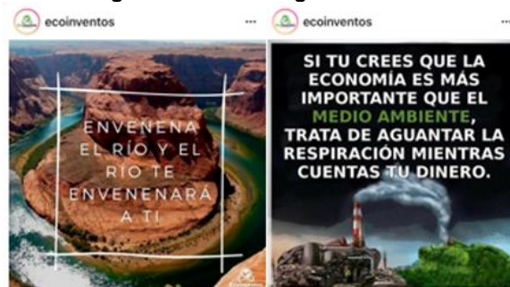
Figure 4. Contrasting cause/effect

Finally, these contrasts can also present a dilemma through a good solution-bad solution dichotomy. Examples of this are shown in Figure 5, where two images are used to express good and bad practices for the planet, through visual contrast. This contrast between two mutually exclusive terms or ideas establishes an aspirational narrative that is projected towards a desirable future, or how things should be. It is suggested as personal choice, appealing to taste and aesthetics.