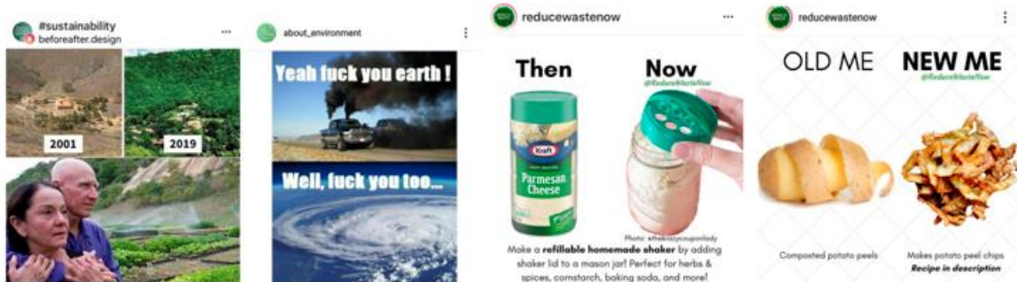
Figure 1. Sequences of change over time

The first image shows a change over time: from desertification to a green, irrigated landscape, thanks to the action of the photographer Sebastião Salgado and his wife Lélia Deluiz Wanick. The second is a projection into the future, toward future outcomes, while the third and fourth show positive change in the personal sphere (presenting everyday objects and food) by learning more sustainable habits. This type of meme (“old me-new me”) suggests that changes at the personal level affect the planet and the environment. Appealing to identity, the “me” is transformed into a more responsible “other me”, seeking to generate empathy and serve as an example.