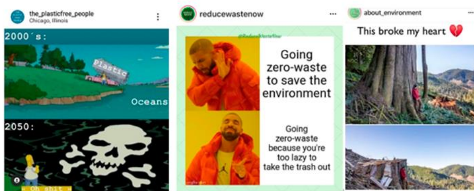
Figure 6. Example contrasting temporality, cause and effect, and emotionality

Whatever the case, besides the degree of humour used, the visual presentation of the set of images analysed here is typical of memes in general: simple composition; predominance of message over aesthetics; rehased, or hastily created images; and short but powerful texts. Nevertheless, as we have observed in our corpus of study, seriousness, and a relatively careful image predominate in memes with environmental content on Instagram, differing from popular memes on other social media. We also have seen that, in the different types found, this contrast between two mutually exclusive terms or ideas establishes a temporal narrative and a future prediction (improvement or deterioration), implying a cause-and-effect relationship and a moral judgement on our action in the world, moving us toward a transformation in the state of things through personal action.