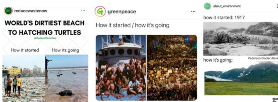
Figure 2. Developmental sequences (how it started-how it’s going)

In the third typology, the change of state is presented by contrasting two orders of things, such as an image of a polluted city and an idealized image of nature. Once again it appeals to the individual: in the first image of the @ecoinventos account, pollution is the product of many (or possibly of people other than the individual in the scene) but just one individual appears to have carried out the action, strengthening the idea that “your” action has a global effect on the planet (implying both individual and collective responsibilities and benefits). The second image presents the negative impact of humans compared to animals (where would you prefer to live?) The next image is possibly more conceptual, as it uses infographics, superimposed over an image of nature. The pictograms are, respectively, pyramidal (evoking the “I”, ego, the individual) and circular, a much more harmonious shape (appealing to “eco”, the circular economy and, thus, nature). In these cases, there is not always a clear temporal vector, but a dilemma (Figure 3).