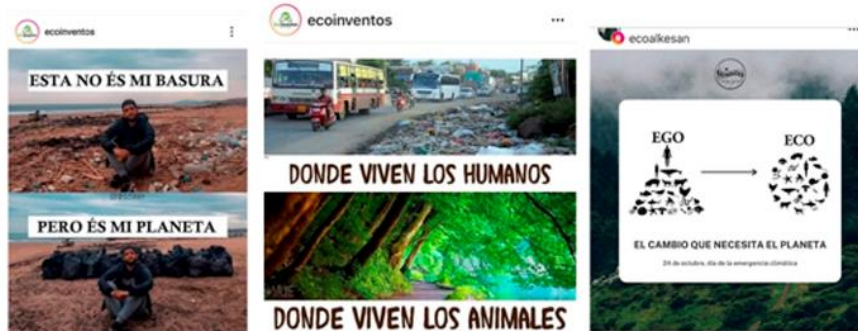
Figure 3. Contrast of two orders or states

The fourth typology raises the degree of abstraction, the following images contrast cause and effect, presenting the dilemma of: if you do something, you'll have to be held accountable for it. In other words, your actions have consequences. Once again, the effect of a collective process is personalized. In both the first image, "envenena el río y el río te envenenará a ti" [if you poison the river, the river will poison you], and in the second (if you prioritize money over the environment you'll become just as polluted), industrial pollution or the capitalist economic systems are transformed due to human irresponsibility and greed. In both cases, a single image condenses the contrast made explicit in the text (figure 4).