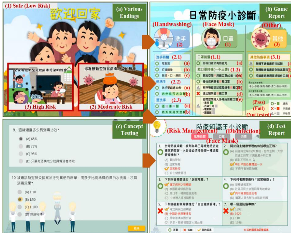
Figure 5. Personalized diagnostic report in WSG-COVID-19.SP

Consequently, users are motivated to further pursue the relevant knowledge and re-test themselves. As such, this model can promote users' COVID-19 prevention knowledge and self-protection measures.